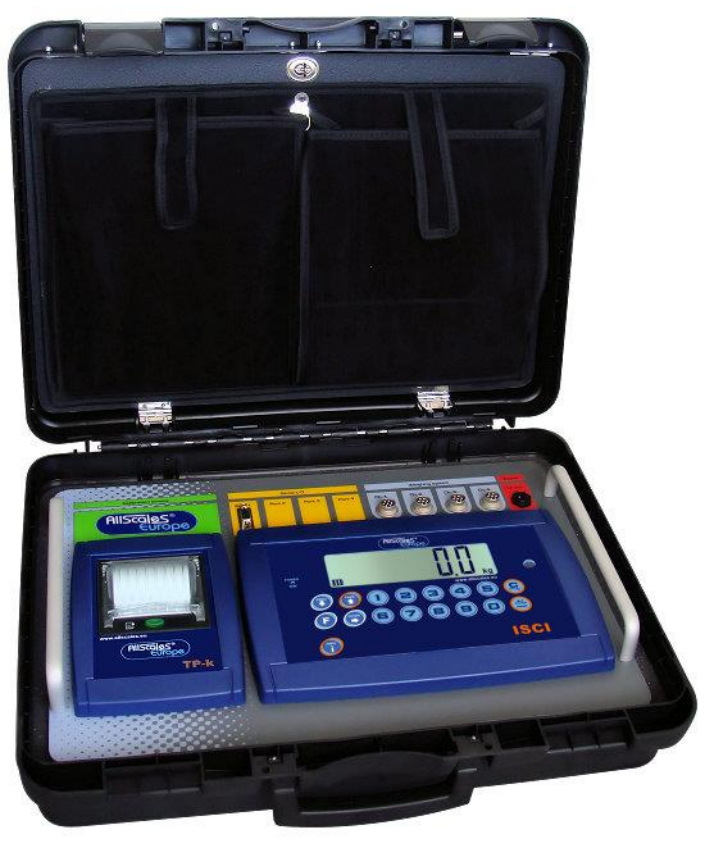
Clearly readable indicator