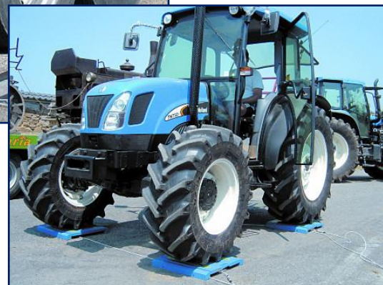
The WAWM weighin platforms can be used in many applications.