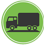
Weight indicator with special firmware for vehicle weighing

Electronic modular weighbridge with separate weighing platforms, composed of modules. Weighing capacities up to 60 tons, CE-verified.